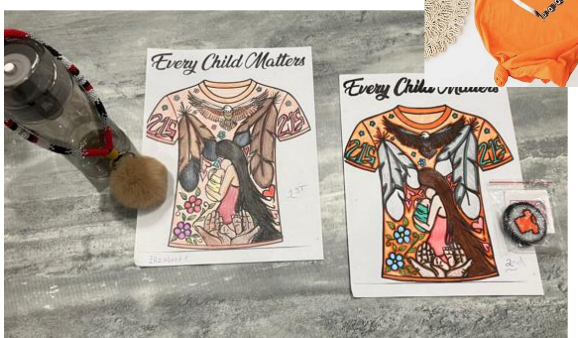
Contest Winners National Day of Truth and Reconciliation

(no school Monday, September 30<sup>th</sup>)