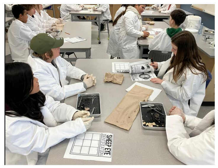
Biology ~ Sheep Eye Dissections