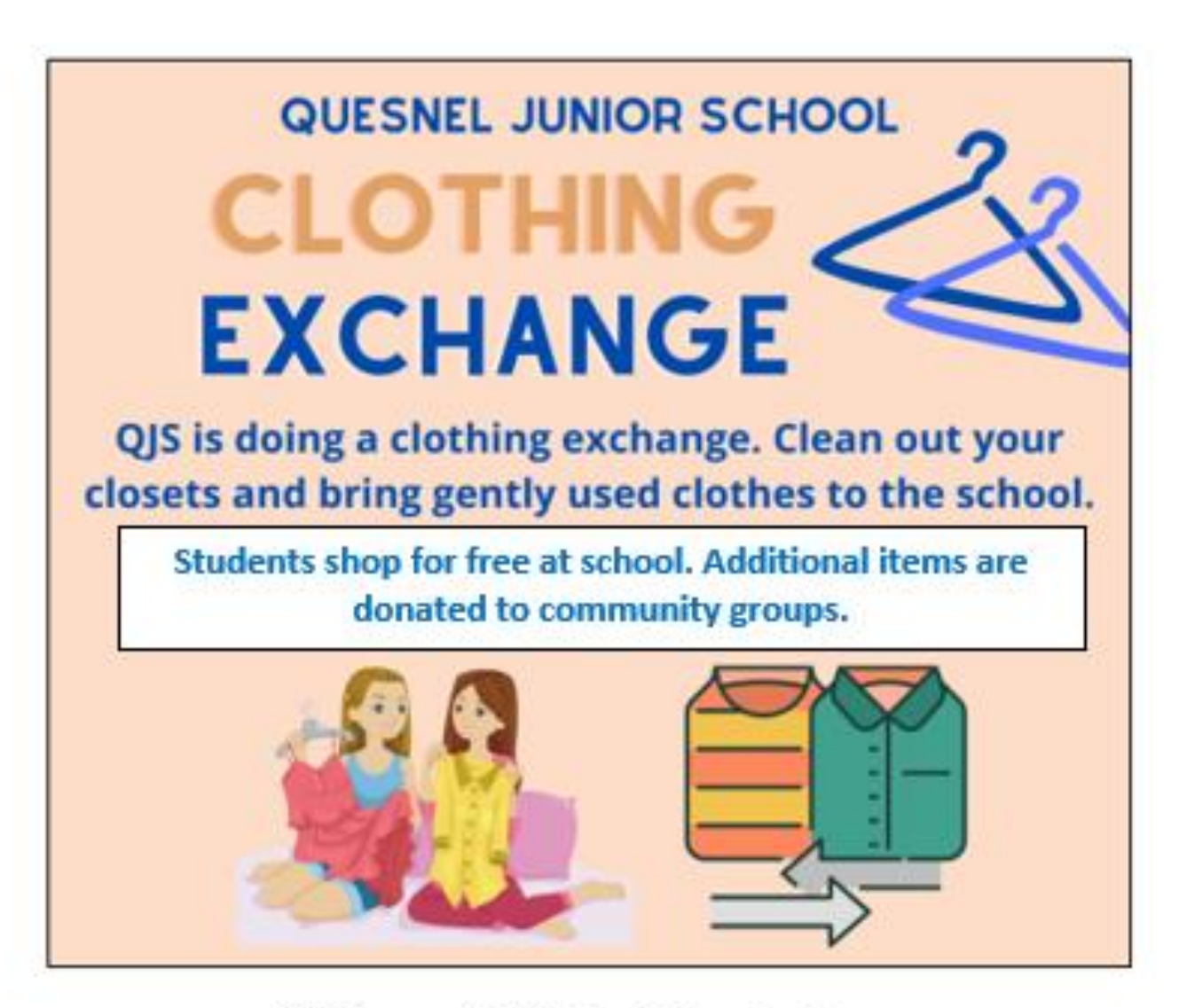
3rd Annual QJS Clothing Exchange

Drop off gently used clothes and accessories to the QJS office between Nov. 28-Dec.8. Clothing should be appropriate for grade 8 & 9 students.